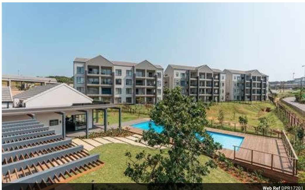
Web Ref DPR17201