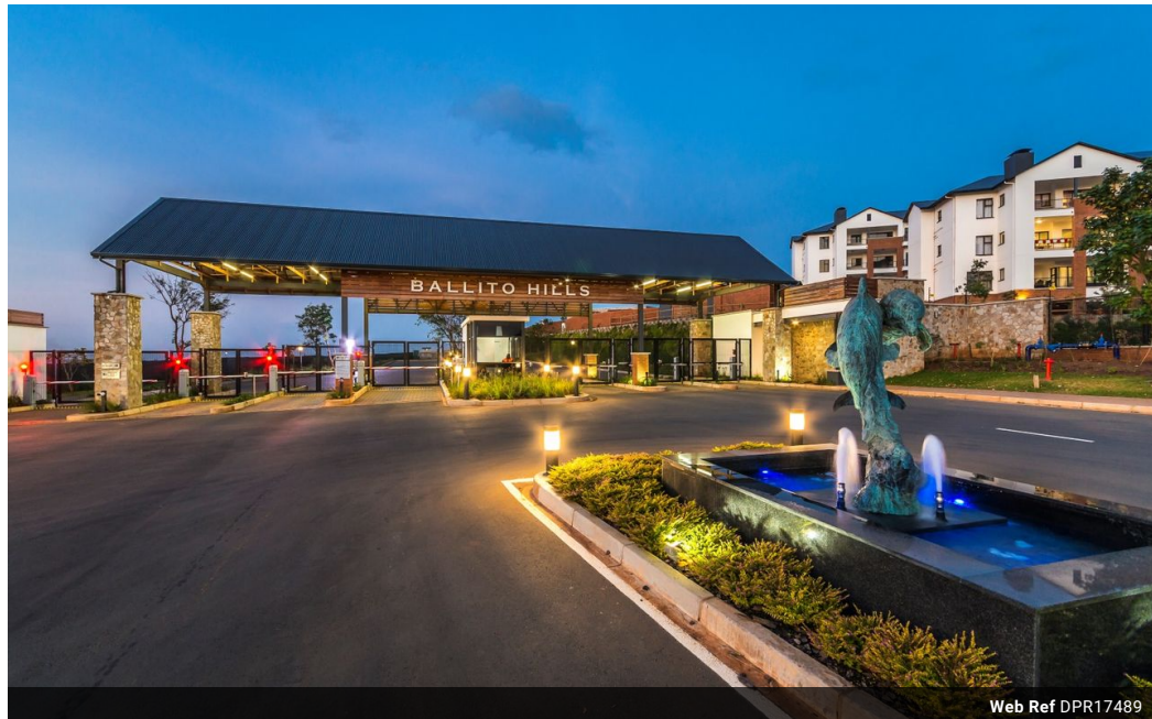
Web Ref DPR17489