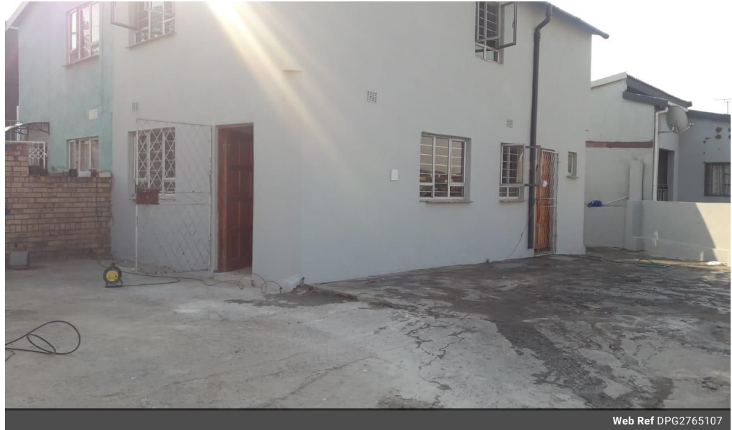
Web Ref DPG2765107

279 Problem Mkhize Road, Essenwood, Durban, 4001