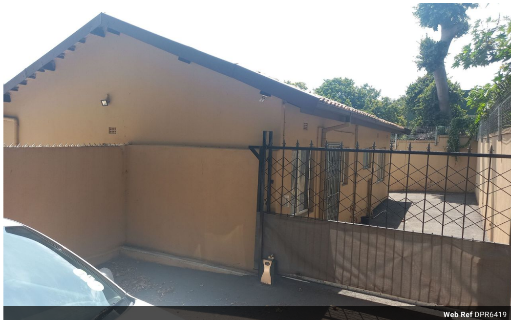
Web Ref DPR6419

343 Anton Lembede Street 511 Perm Building Durban 4001