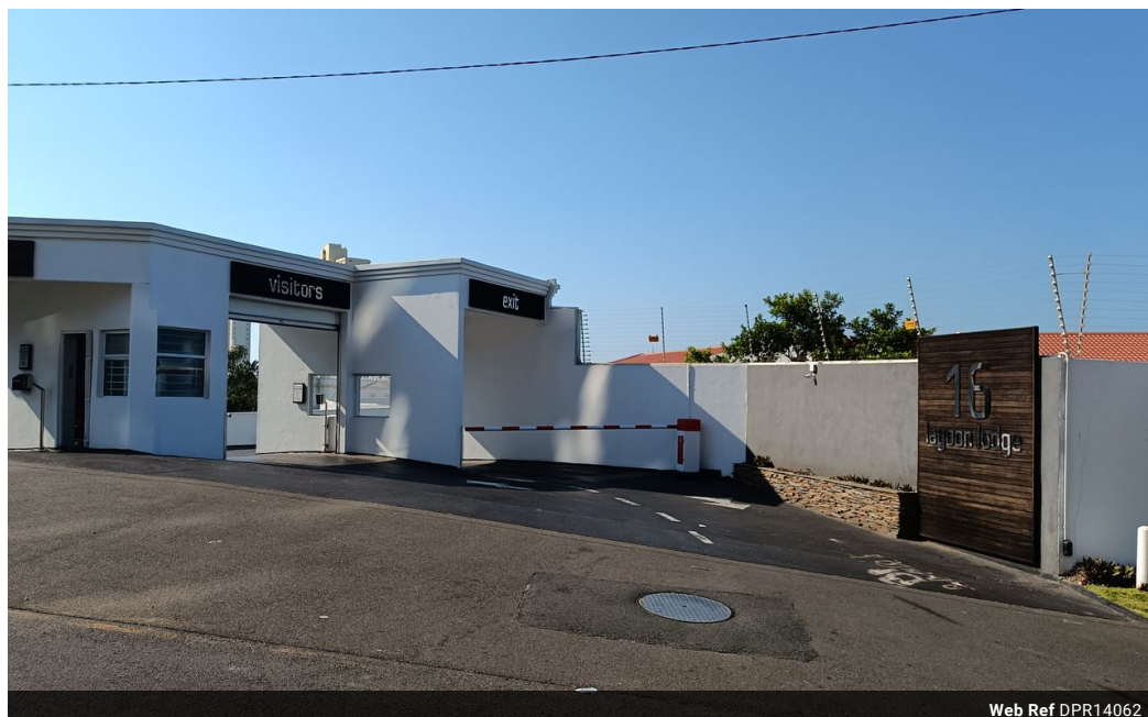
Web Ref DPR14062