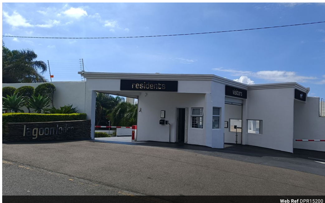
Web Ref DPR15200