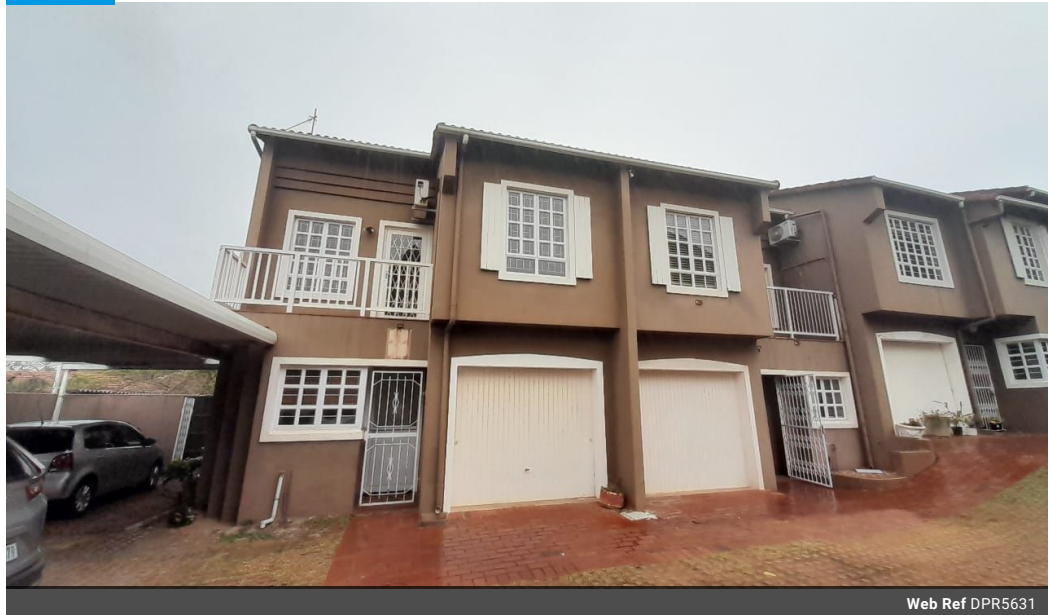
Web Ref DPR5631