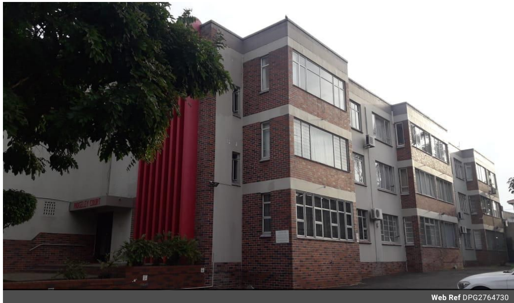
Web Ref DPG2764730

279 Problem Mkhize Road, Essenwood, Durban, 4001