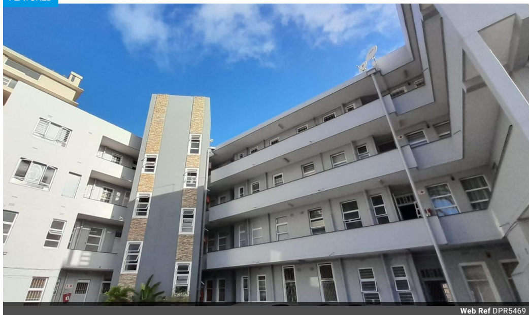
Web Ref DPR5469