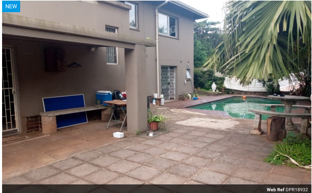
Web Ref DPR18932