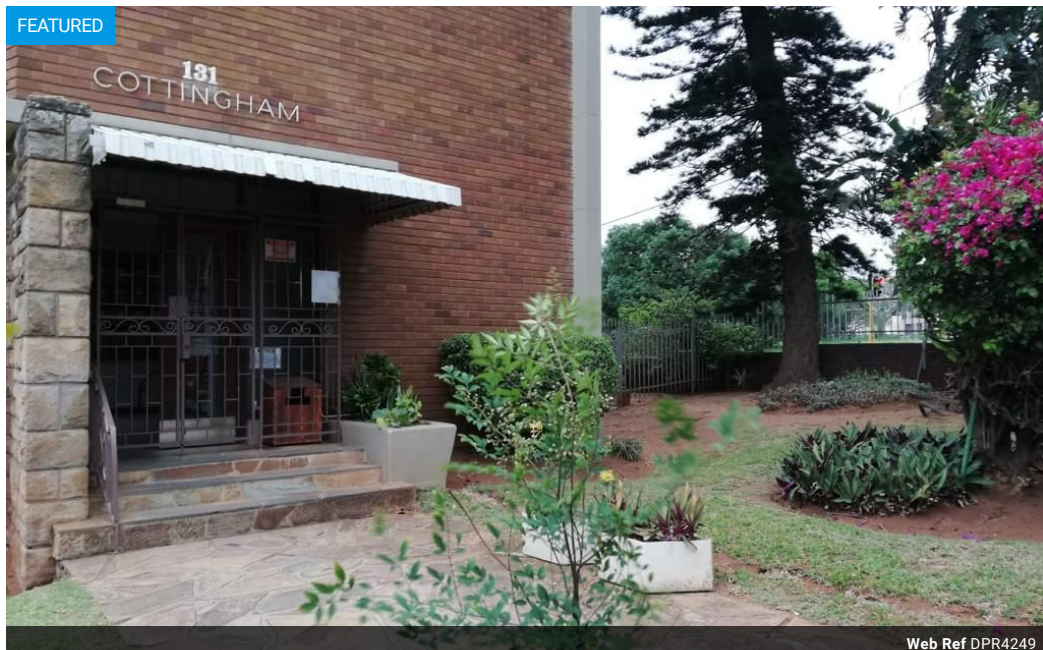
Web Ref DPR4249

279 Problem Mkhize Road, Essenwood, Durban, 4001