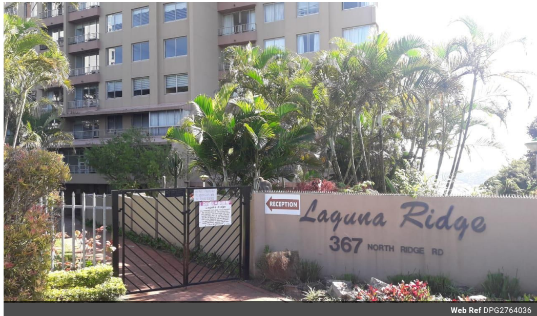
Web Ref DPG2764036

279 Problem Mkhize Road, Essenwood, Durban, 4001