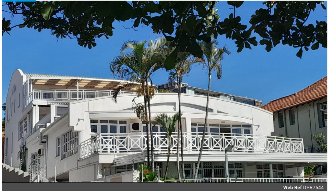
Web Ref DPR7544