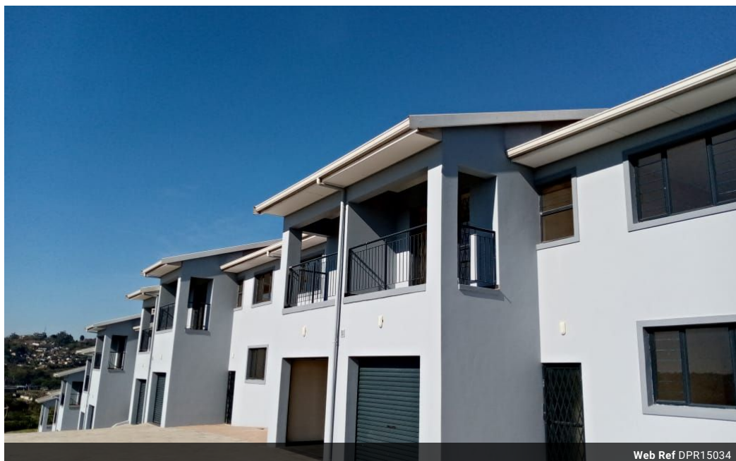
Web Ref DPR15034