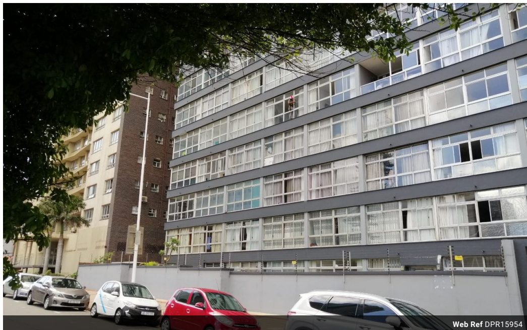
Web Ref DPR15954

3 Oslo Building 394 Ester Roberts Road Glenwood Durban 4001