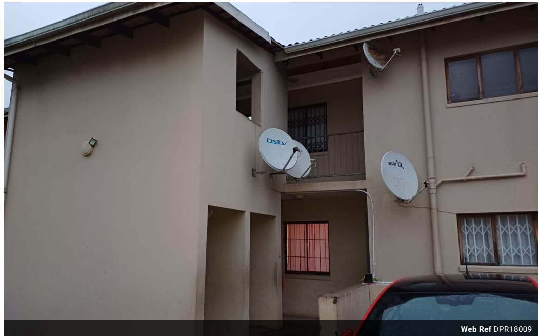
Web Ref DPR18009

Shop 2, 120 Stella Road Hillary Durban 4094