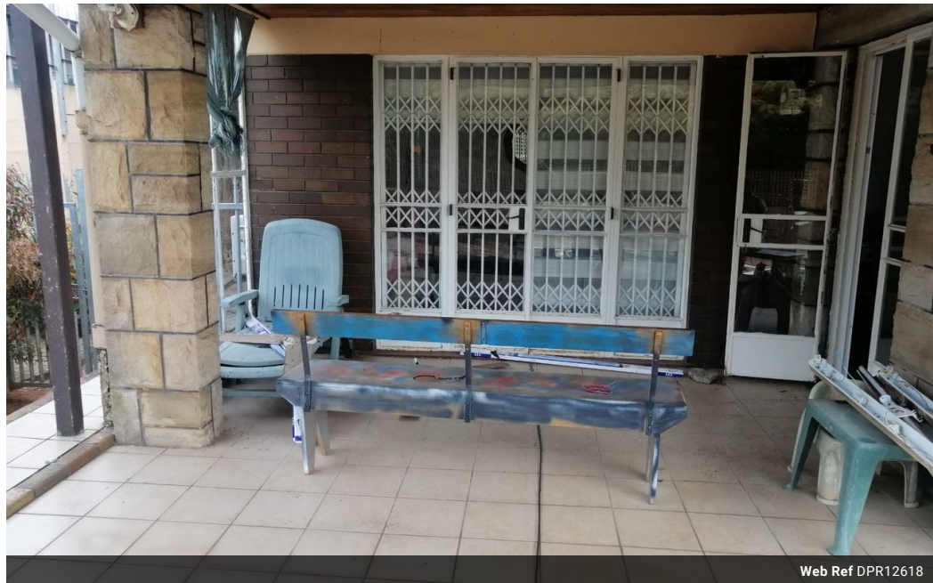
Web Ref DPR12618

3 Oslo Building 394 Ester Roberts Road Glenwood Durban 4001