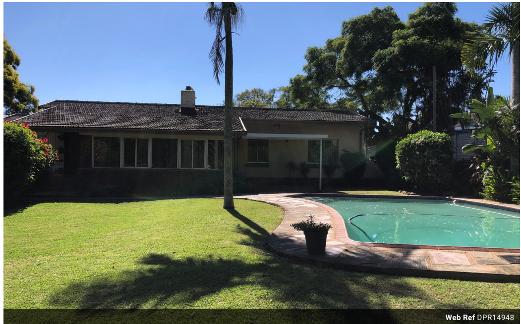
Web Ref DPR14948

Shop 1, Gordana Court, 22/26 Salisbury Avenue, Westville