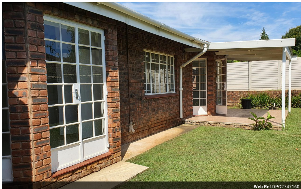
Web Ref DPG2747160