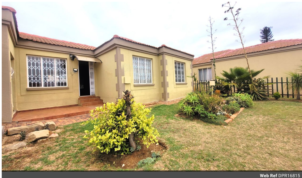
Web Ref DPR16815

95 Victoria Street Oakdene Johannesburg South 2190