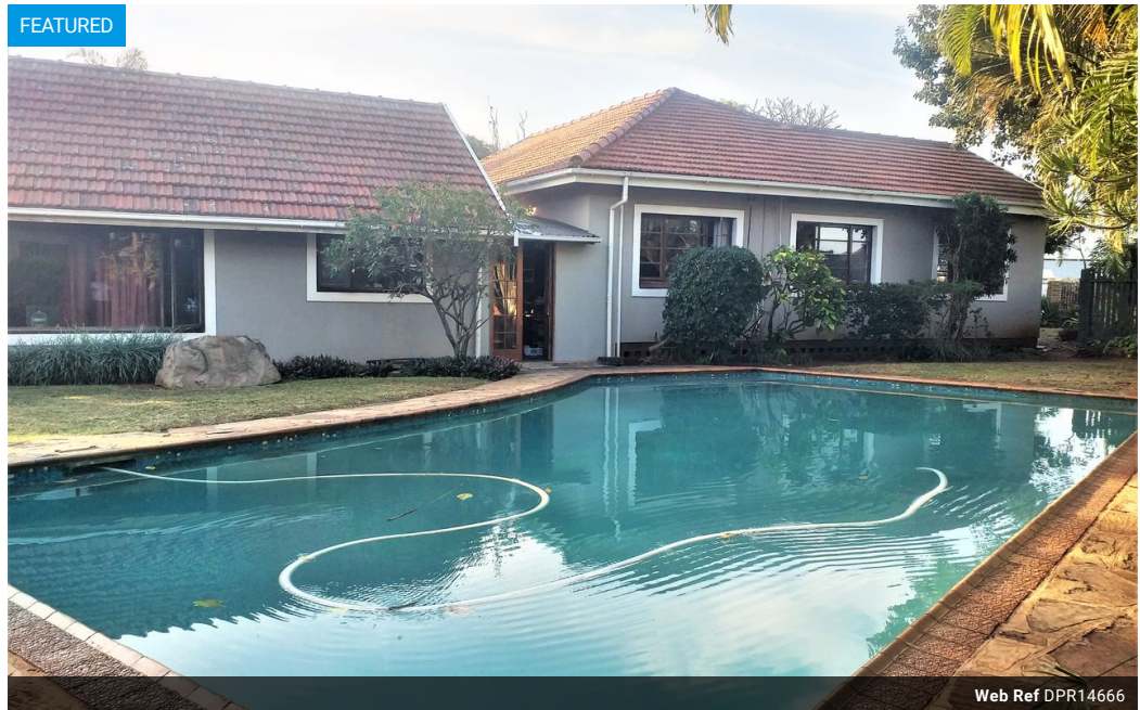
Web Ref DPR14666