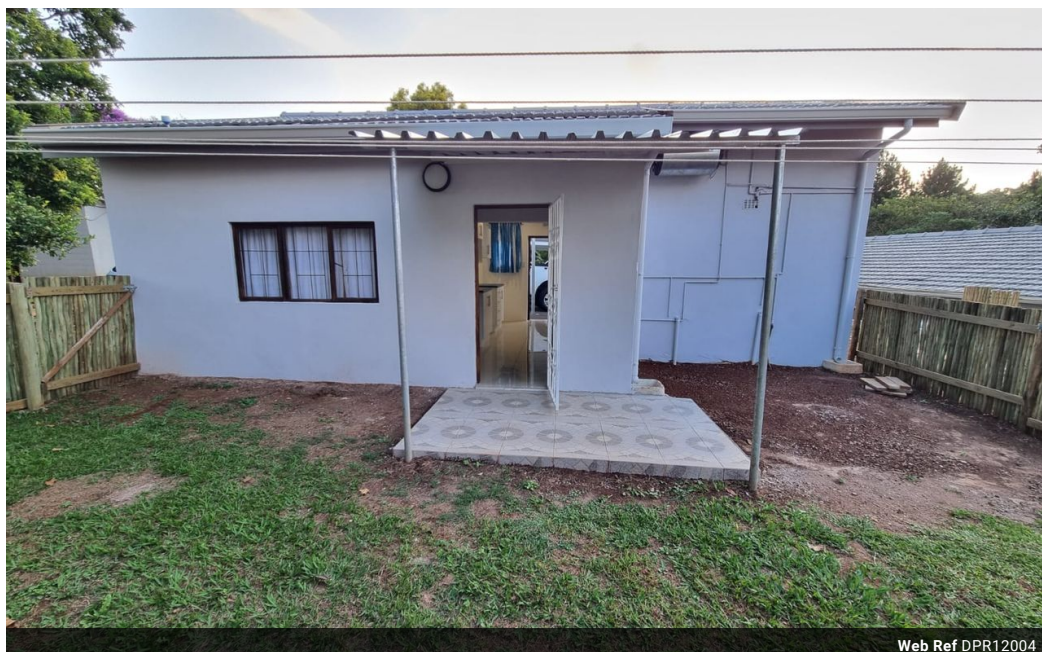
Web Ref DPR12004