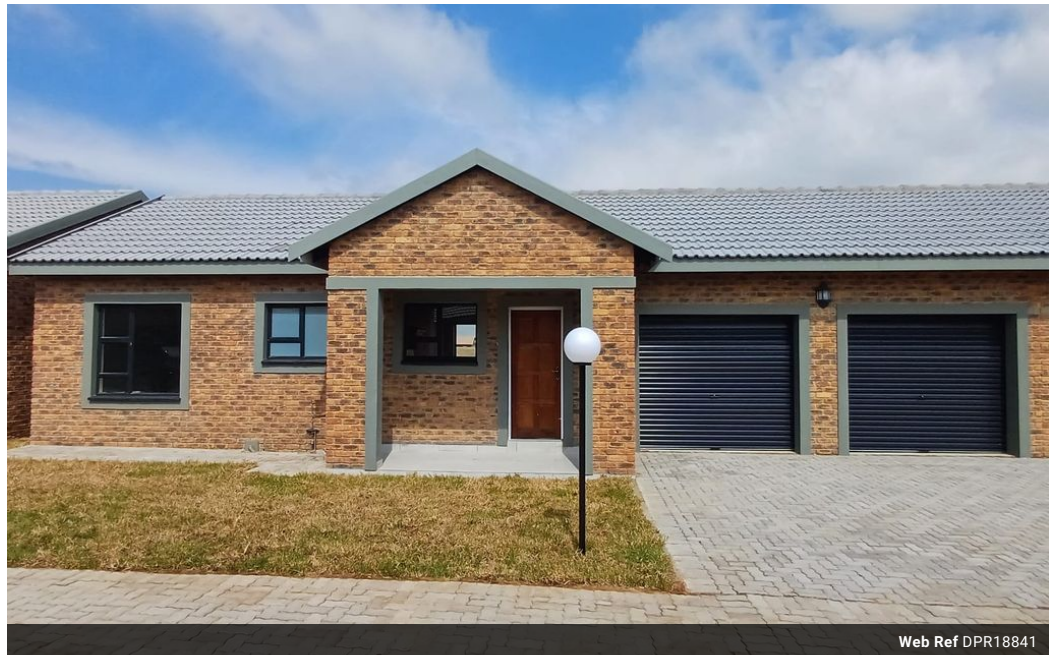
Web Ref DPR18841

24 Glynn Street Rothdene, Meyerton, 1961