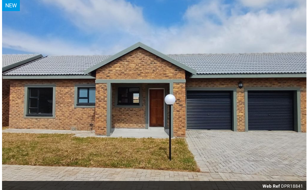
Web Ref DPR18841

24 Glynn Street Rothdene, Meyerton, 1961