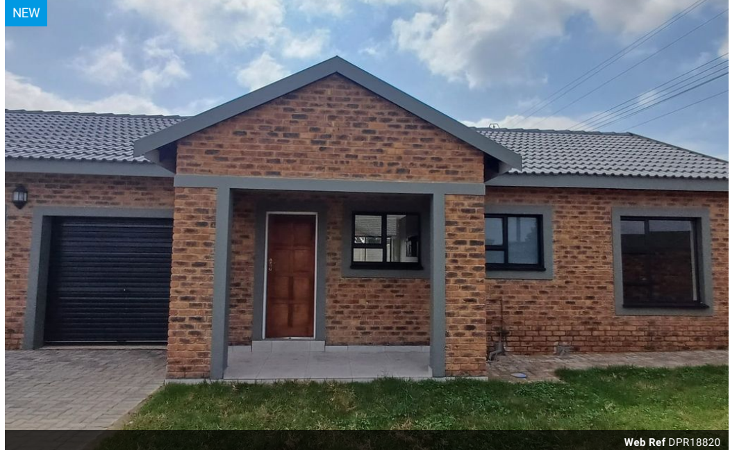
Web Ref DPR18820

24 Glynn Street Rothdene, Meyerton, 1961