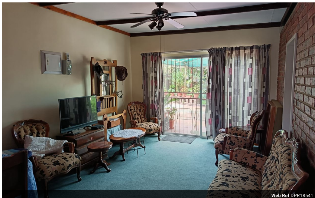
Web Ref DPR18541

24 Glynn Street Rothdene, Meyerton, 1961