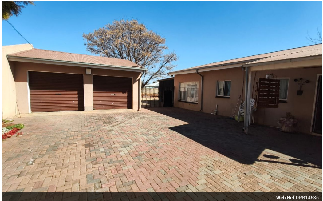
Web Ref DPR14636

18 Klipriver Drive Three Rivers Vereeniging