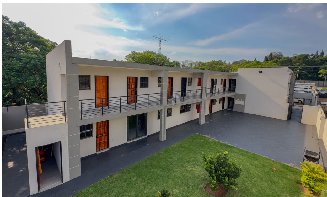
SOLE MANDATE, STUDENT ACCOMMODATION

7 Arlon Place, 1299 South Street, Hatfield, Pretoria