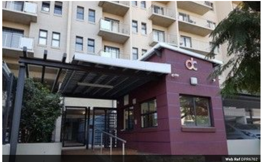
Web Ref DPR6762