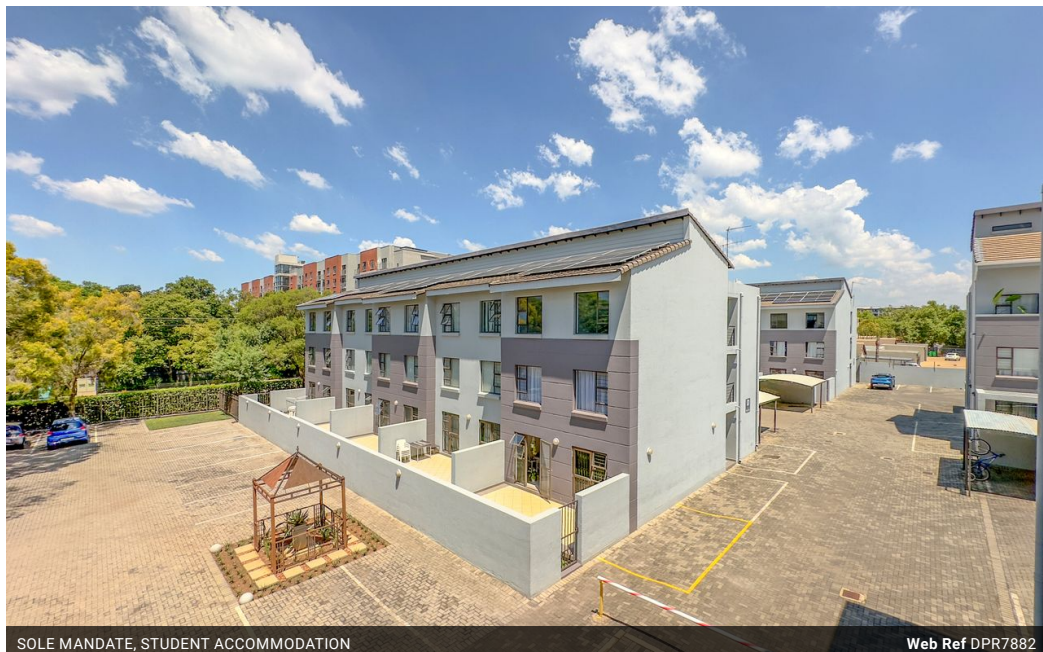
SOLE MANDATE, STUDENT ACCOMMODATION

7 Arlon Place, 1299 South Street, Hatfield, Pretoria