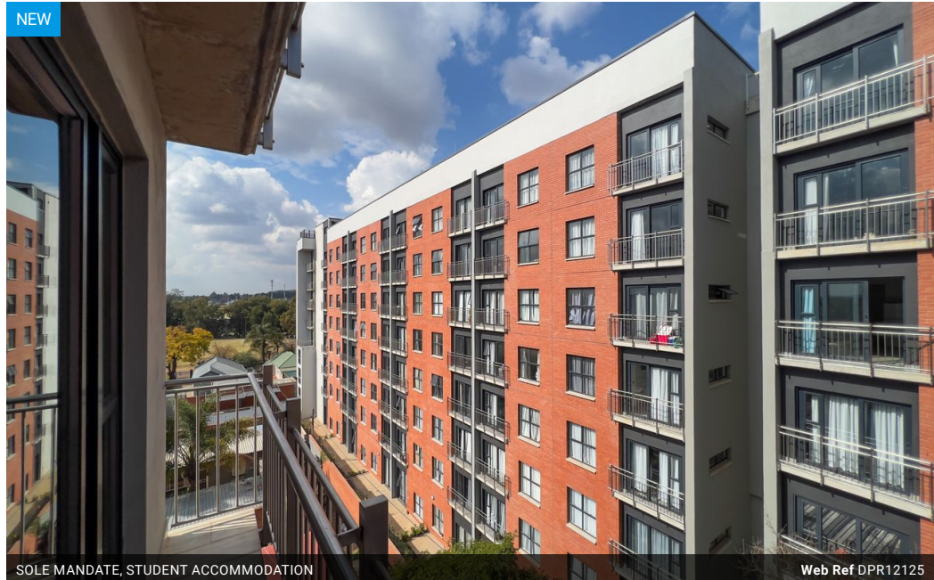
SOLE MANDATE, STUDENT ACCOMMODATION

7 Arlon Place, 1299 South Street, Hatfield, Pretoria