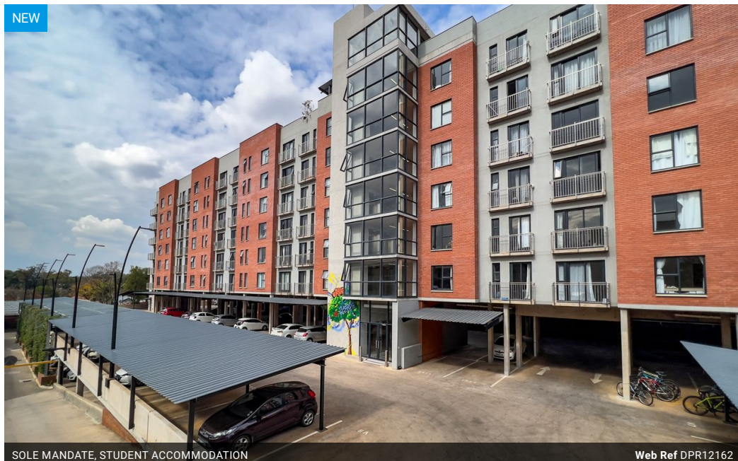
SOLE MANDATE, STUDENT ACCOMMODATION

7 Arlon Place, 1299 South Street, Hatfield, Pretoria