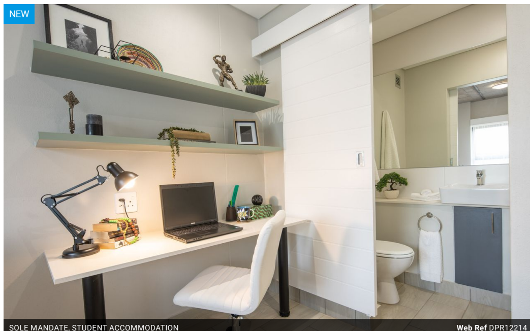
SOLE MANDATE, STUDENT ACCOMMODATION

7 Arlon Place, 1299 South Street, Hatfield, Pretoria