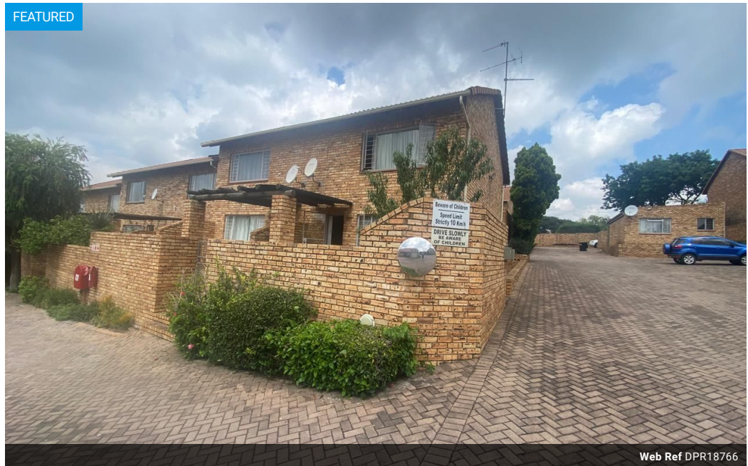
Web Ref DPR18766