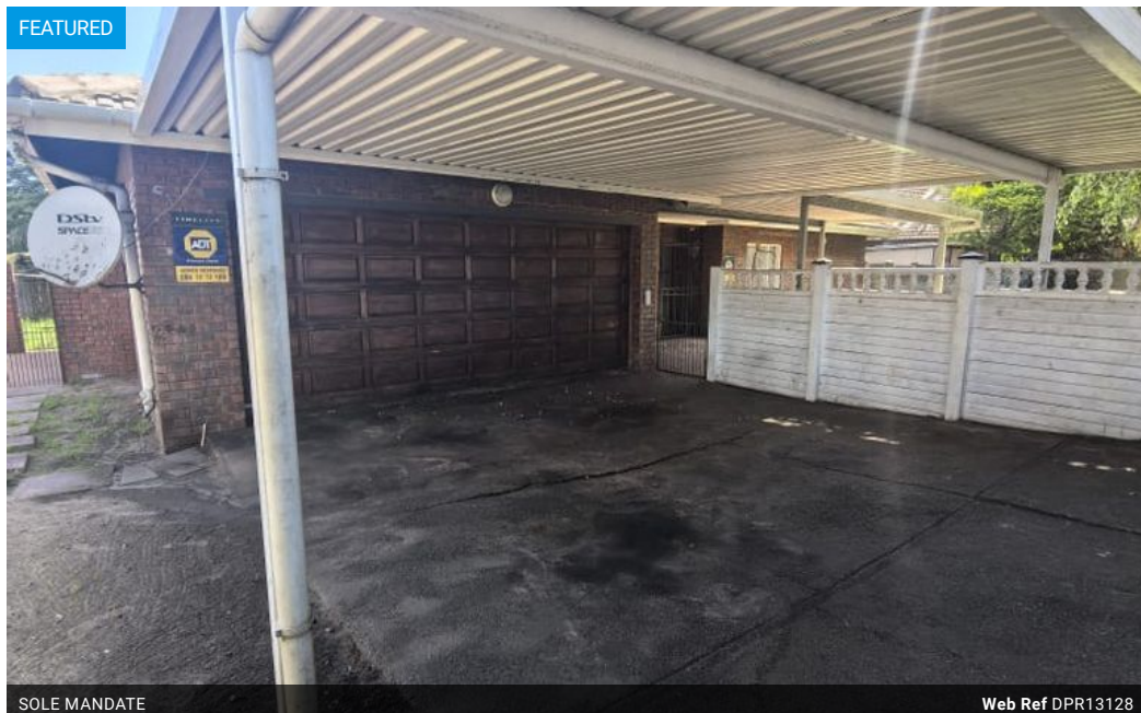
SOLE MANDATE Web Ref DPR13128