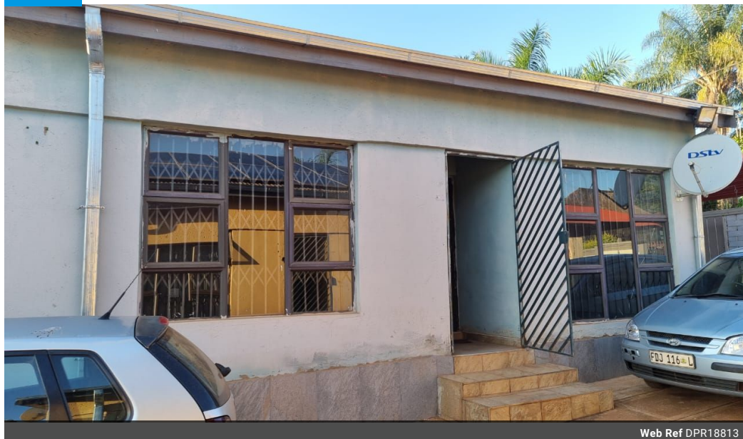
Web Ref DPR18813