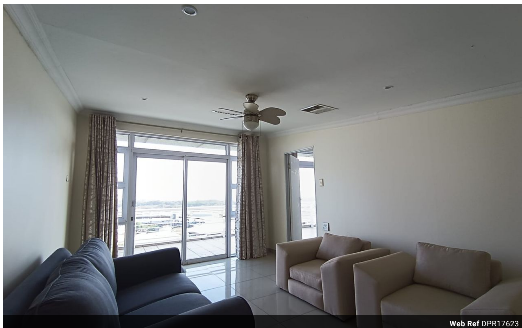
Web Ref DPR17623