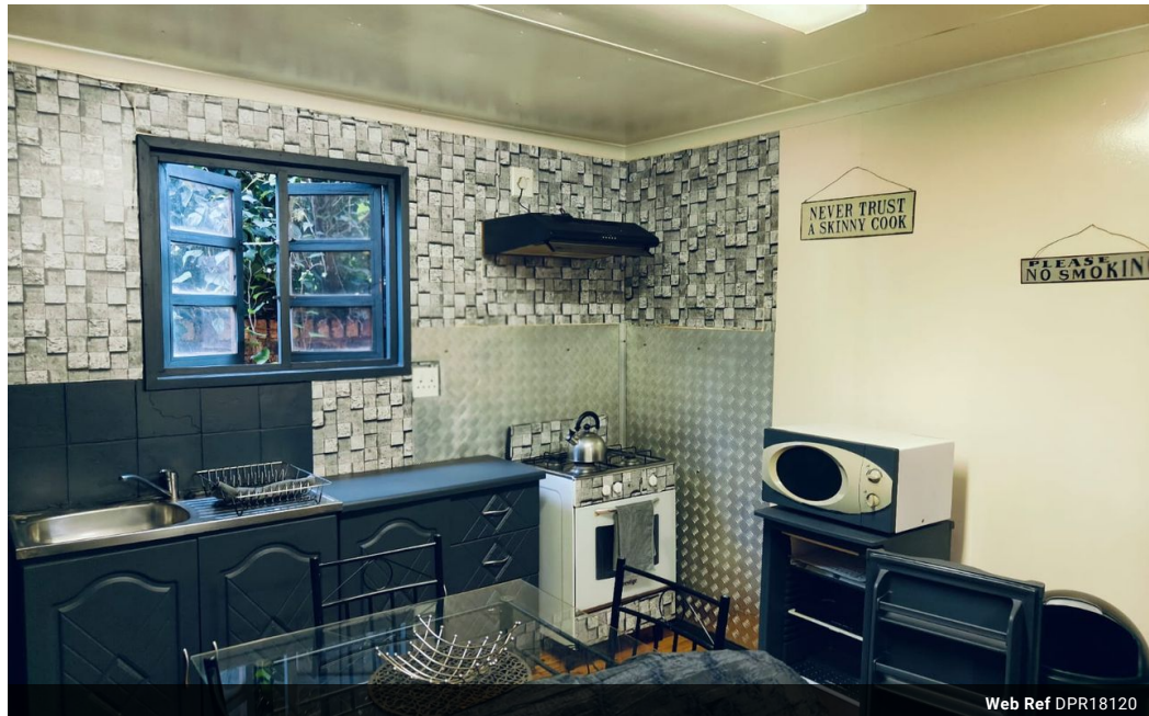
Web Ref DPR18120

18 Klipriver Drive Three Rivers Vereeniging