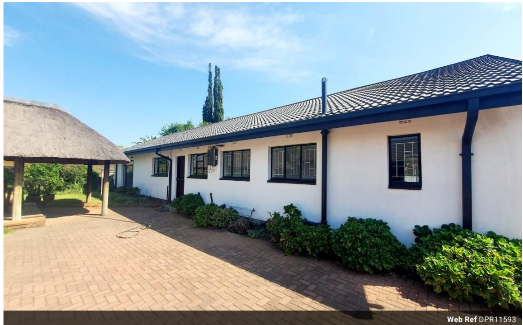
Web Ref DPR11593

18 Klipriver Drive Three Rivers Vereeniging