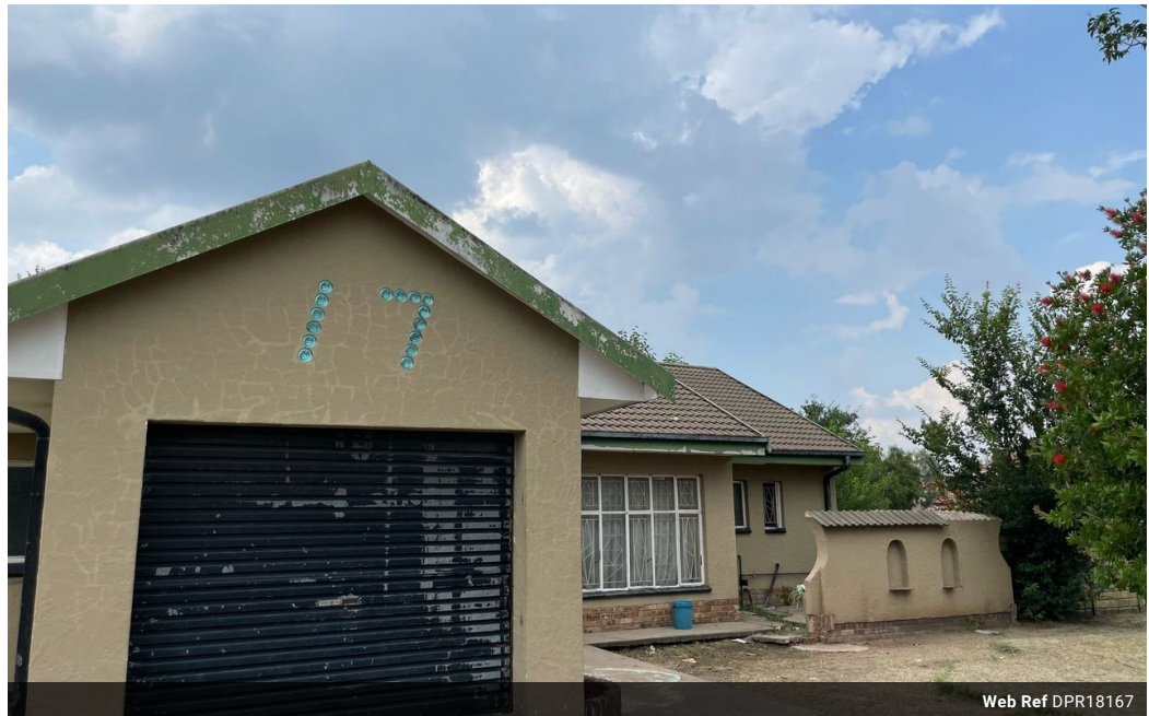
Web Ref DPR18167

Shop 2, The Palms Shopping Center, Louis Trichardt Blvd, Vanderbijlpark, 1911