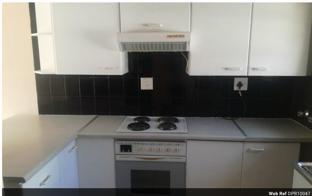
Web Ref DPR10047

18 Klipriver Drive Three Rivers Vereeniging