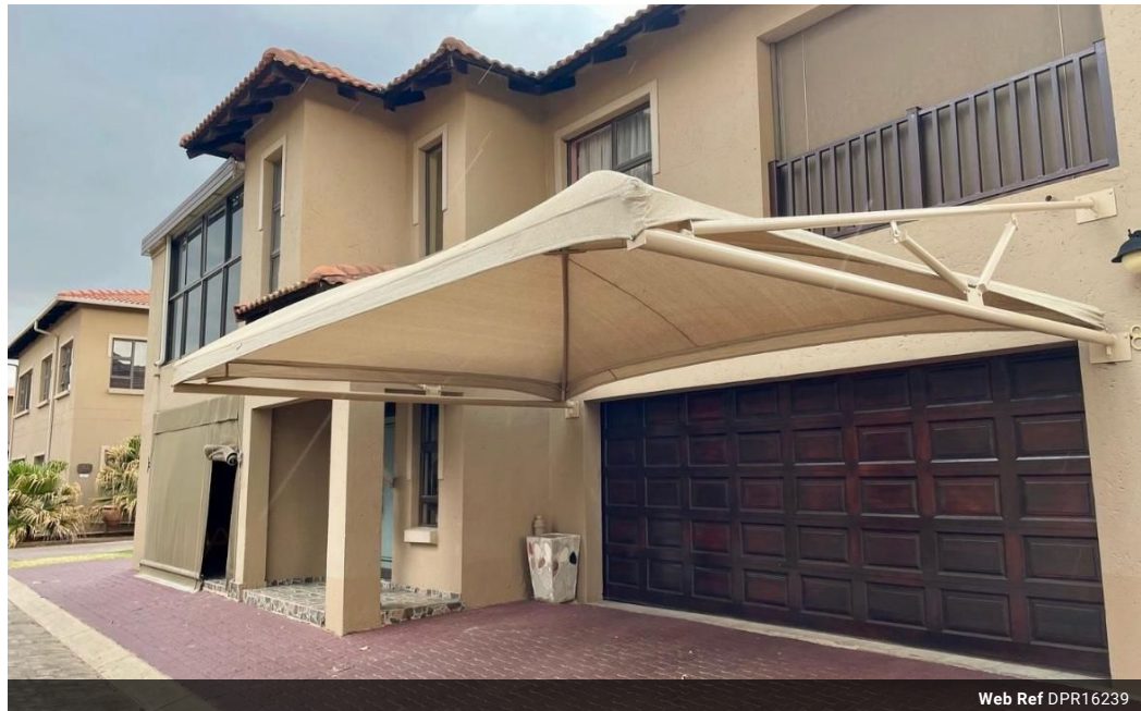
Web Ref DPR16239

18 Klipriver Drive Three Rivers Vereeniging