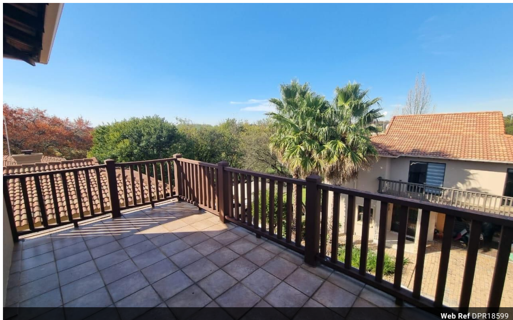
Web Ref DPR18599

18 Klipriver Drive Three Rivers Vereeniging