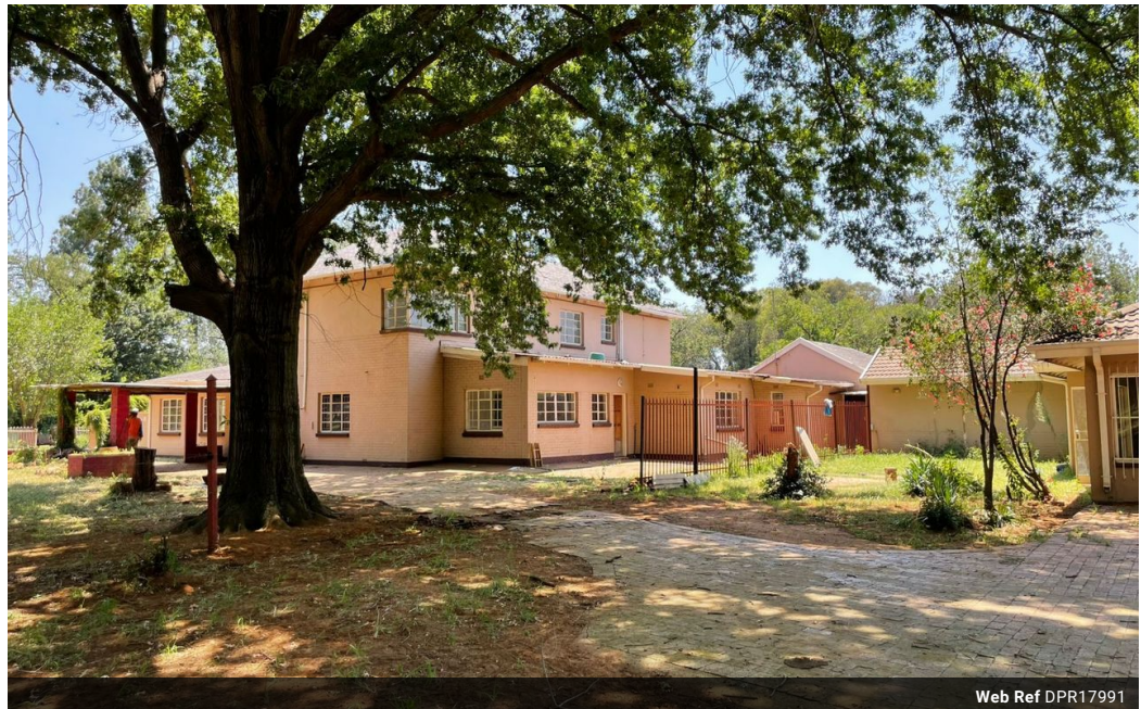
Web Ref DPR17991

18 Klipriver Drive Three Rivers Vereeniging