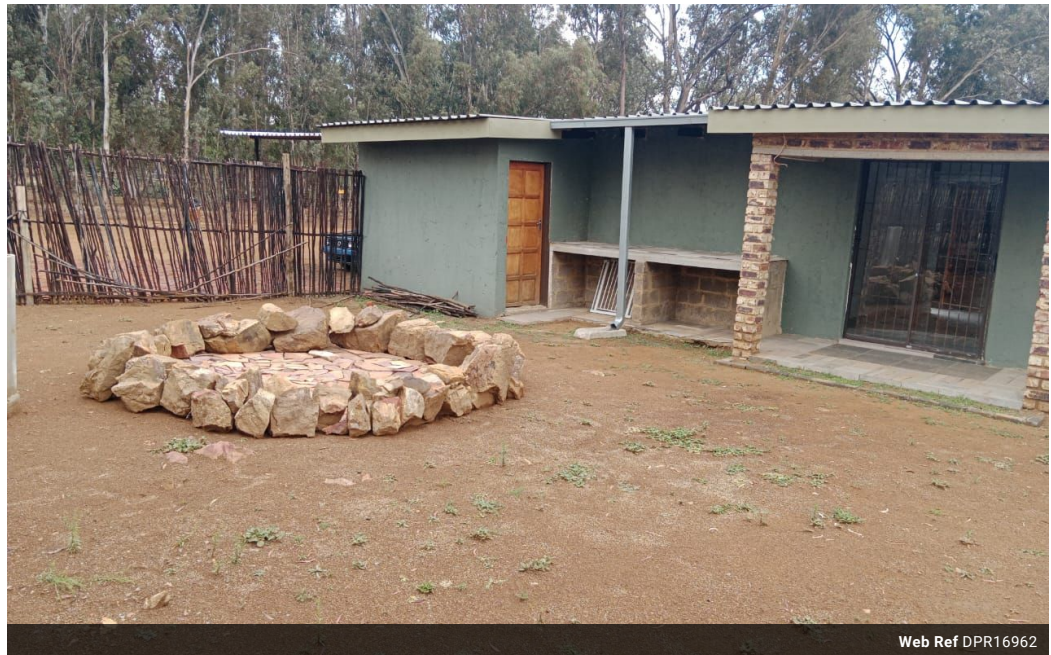
Web Ref DPR16962

24 Glynn Street Rothdene, Meyerton, 1961