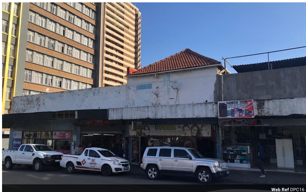
Web Ref DPC16